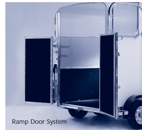
Ramp Door System